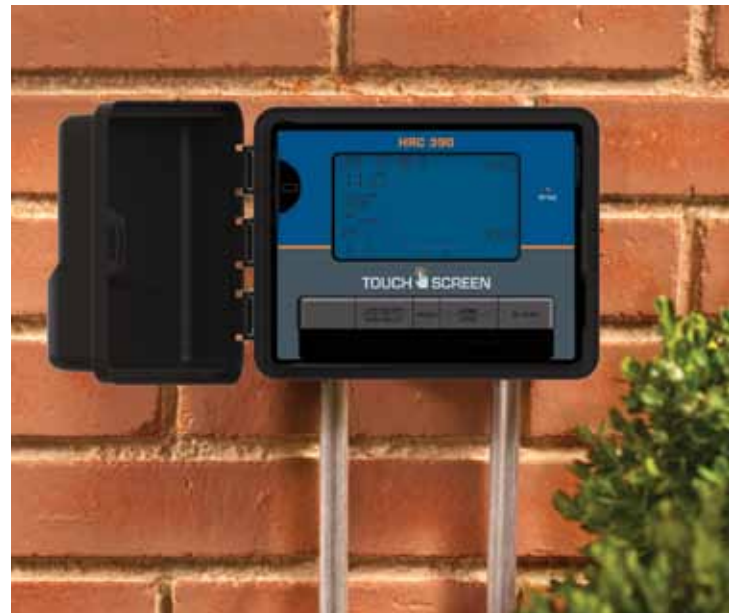
Outdoor Installation with 1/2" Conduit